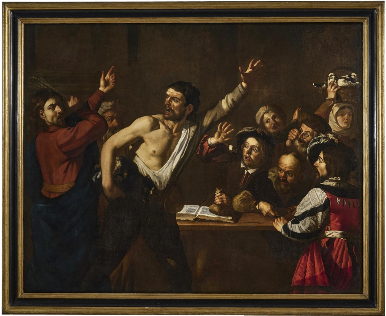
Dirck van Baburen, Christ driving the money-lenders from the Temple , c. 1618