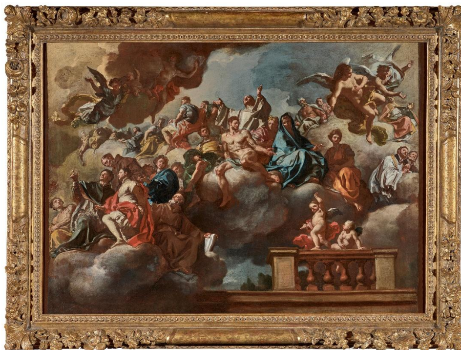
Francesco Solimena, Saints in Glory , c. 1726

Reflecting Robilant+Voena's position as one of the leading international dealers of Baroque art , the focal point of the stand is a masterpiece by Utrecht Caravaggista Dirck van Baburen (pictured above), painted during the most prolific moment of his 8-year stay in Rome in the early 17 th century. This important work will go on display in the Eternal City for the first time since 1987, when it appeared on the art market after centuries of obscurity.