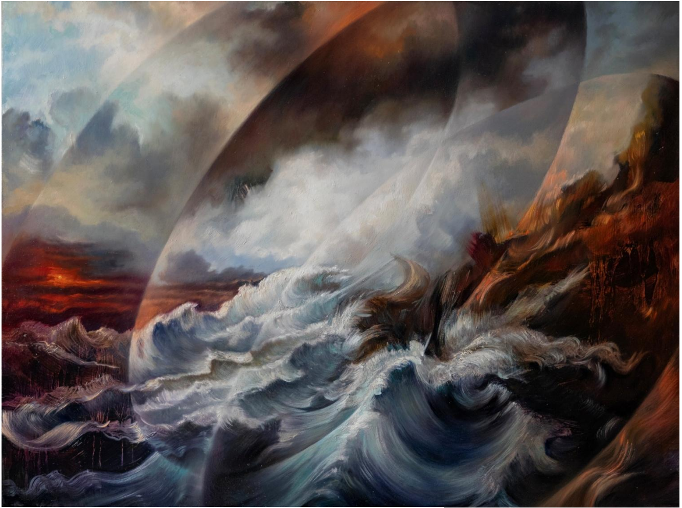
The Alchemist at Sea , 2026, oil on panel, 45.7 x 61 cm (18 x 24 in.).