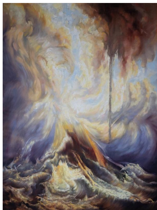
Left: J.M.W. Turner, The Splügen Pass , 1842–43.