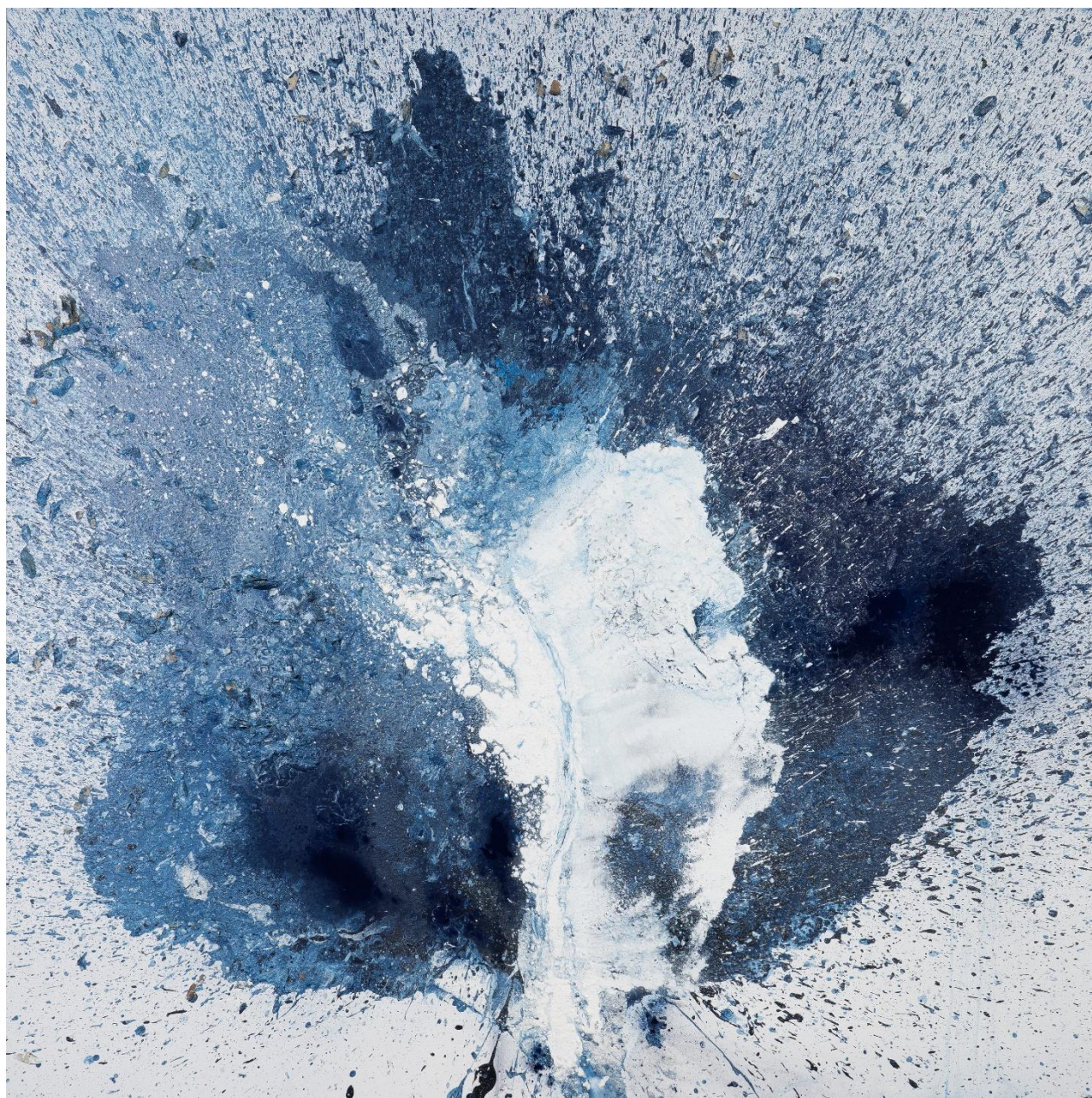
Bleu Monochrome (23 072 NP) , 2023, mixed media on canvas, 200 x 200 cm (78 3/4 x 78 3/4 in.)