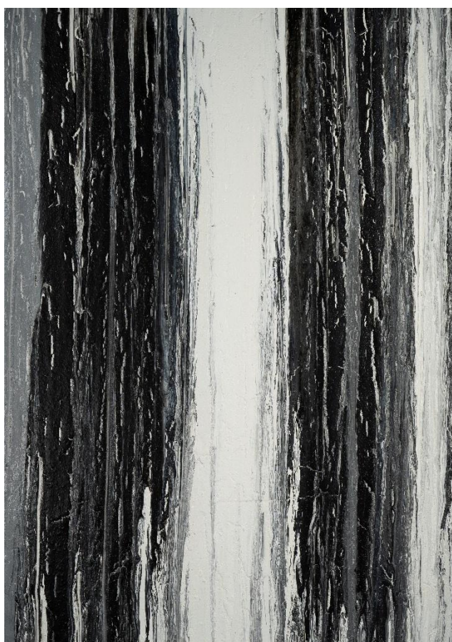
North Pole (24 010 NP) , 2024, mixed media on canvas, 183 x 130 cm (72 x 51 1/8 in.)