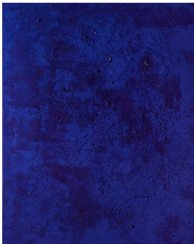
Bleu Monochrome (13 027 BM) , 2013, mixed media on canvas, 162 x 130 cm (63 3/4 x 51 1/8 in..)