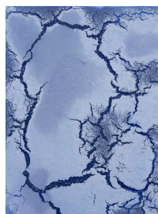
Bleu Monochrome (24 048 BM) , 2024, mixed media on canvas, 40 x 30 cm (15 3/4 x 11 3/4 in.)