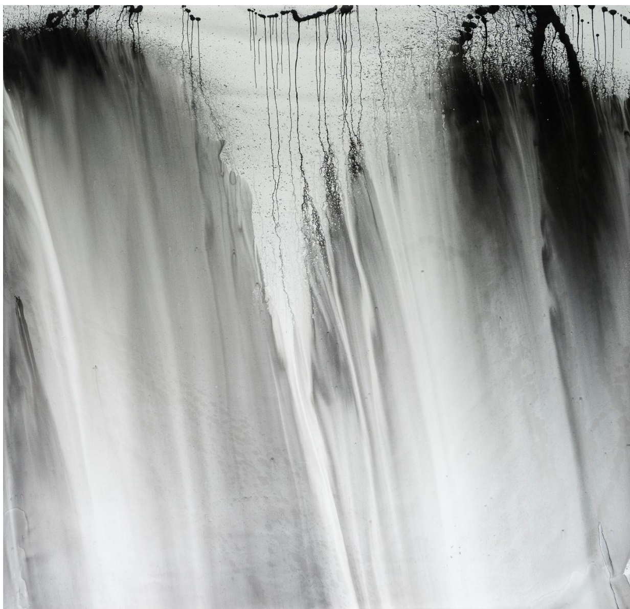
North Pole (25 014 NP), 2025, mixed media on canvas, 400 x 400 cm (157 1/2 x 157 1/2 in.)