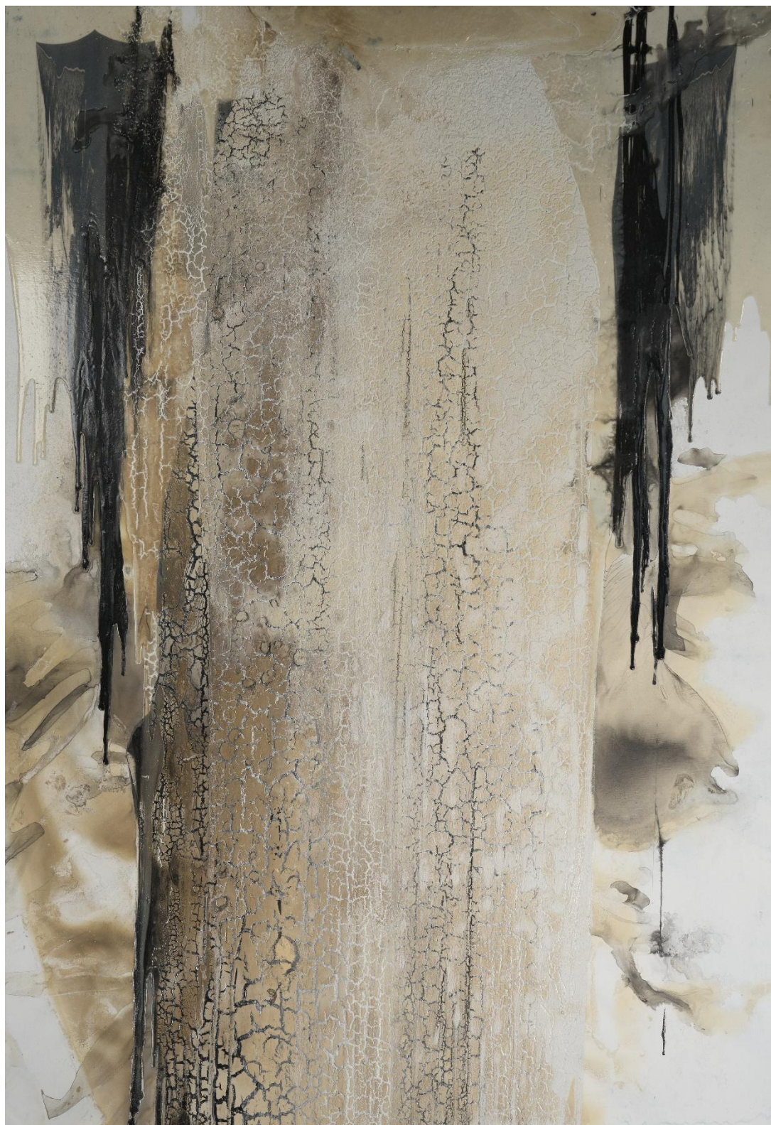
North Pole (25 002 NP) , 2025, mixed media on canvas, 320 x 220 cm (126 x 86 5/8 in.)