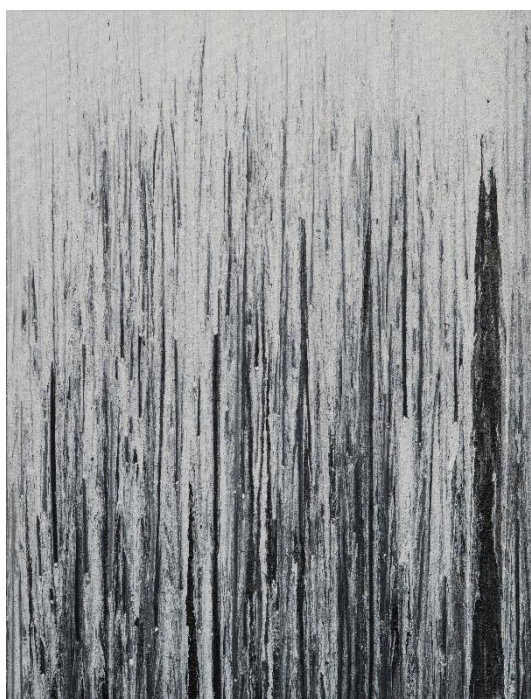
North Pole (25 058 NP) , 2025, mixed media on canvas, 116 x 89 cm (45 5/8 x 35 in.)