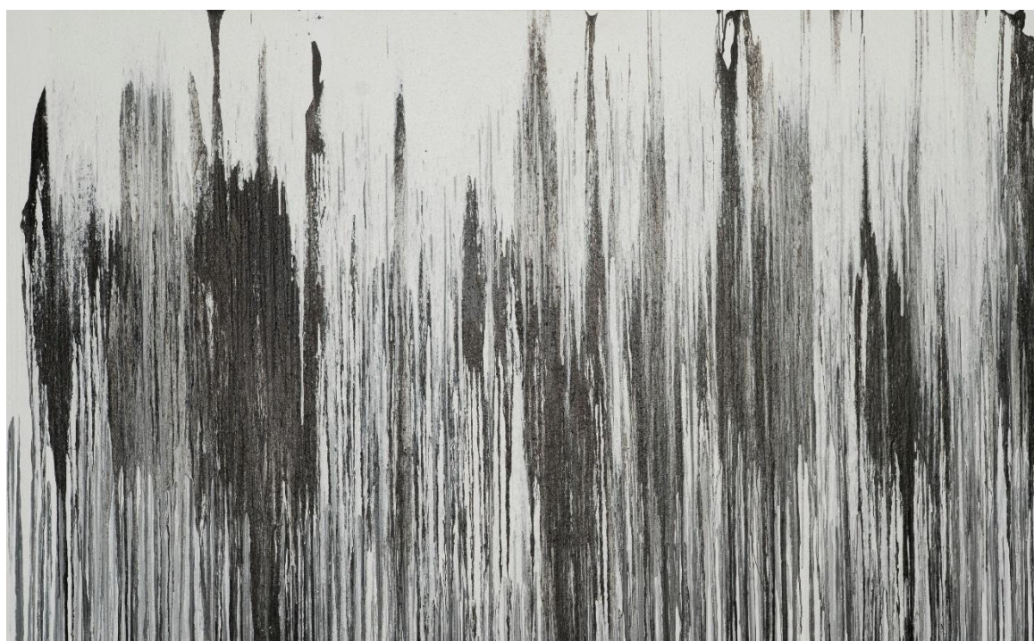
North Pole (25 062 NP) , 2025, mixed media on canvas, 392 x 240 cm (154 3/8 x 94 1/2 in.)