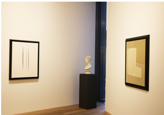
Lucio Fontana. December – January 2015-2016, St. Moritz