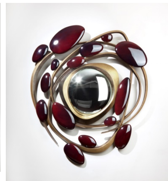
Miroir TUMULTE Edition of 20 - 2010 Patinated bronze, lacquered wood, mirror