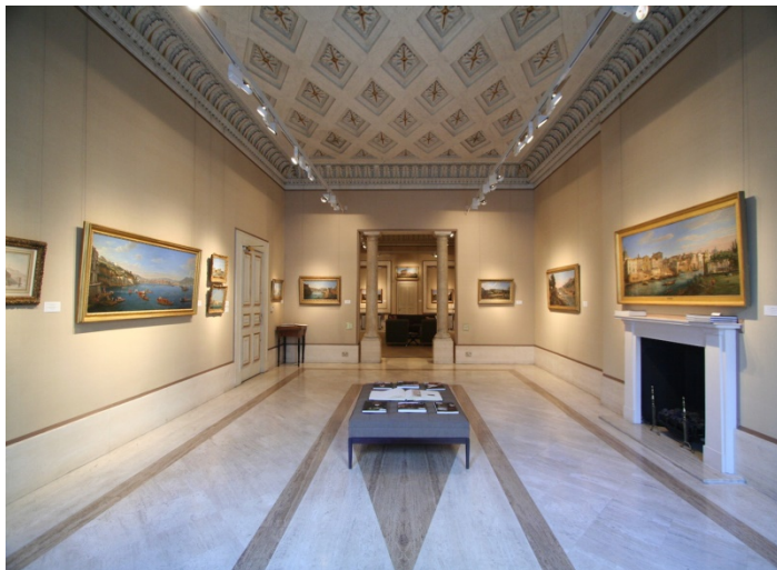
Gaspar van Wittel. Italian Views from the Early 1700s. 19 November - 19 December 2008, London