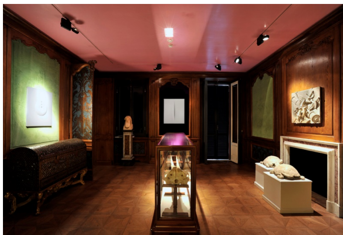
White Marble & Painting from the Antiquity to now. 6 April - 10 May 2013, Milano

LONDON 38 DOVER STREET, W1S 4NL, TEL+442074091540