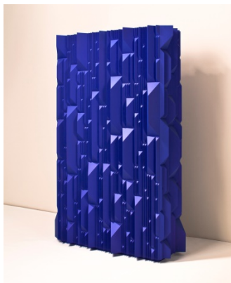
Armoire PARTITION Edition of 20 - 2012 Blue lacquered wood, sliding doors