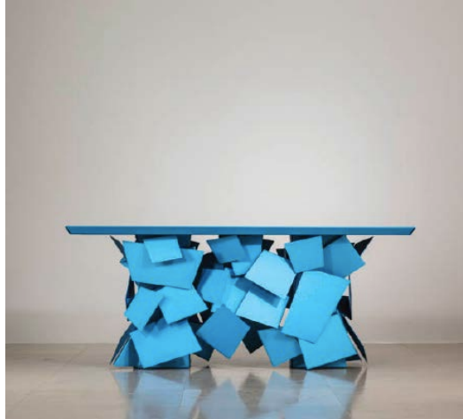
Console ORIGAMI Edition of 40, 2015 Blue, anodized aluminium

Hervé van der Straeten's first show in Milan: Robilant+Voena present a selection of works by the artist.