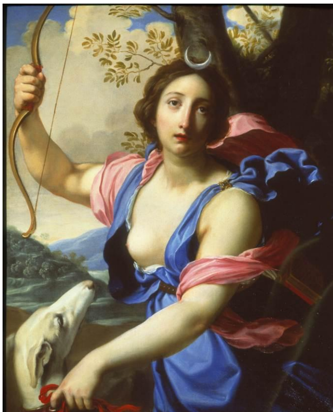
Left CESARE DANDINI

Signed and dated lower left, on the stone table edge: Mlle Vallayer 1777