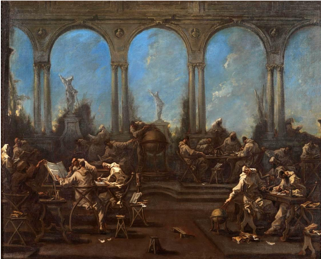
Above ALESSANDRO MAGNASCO