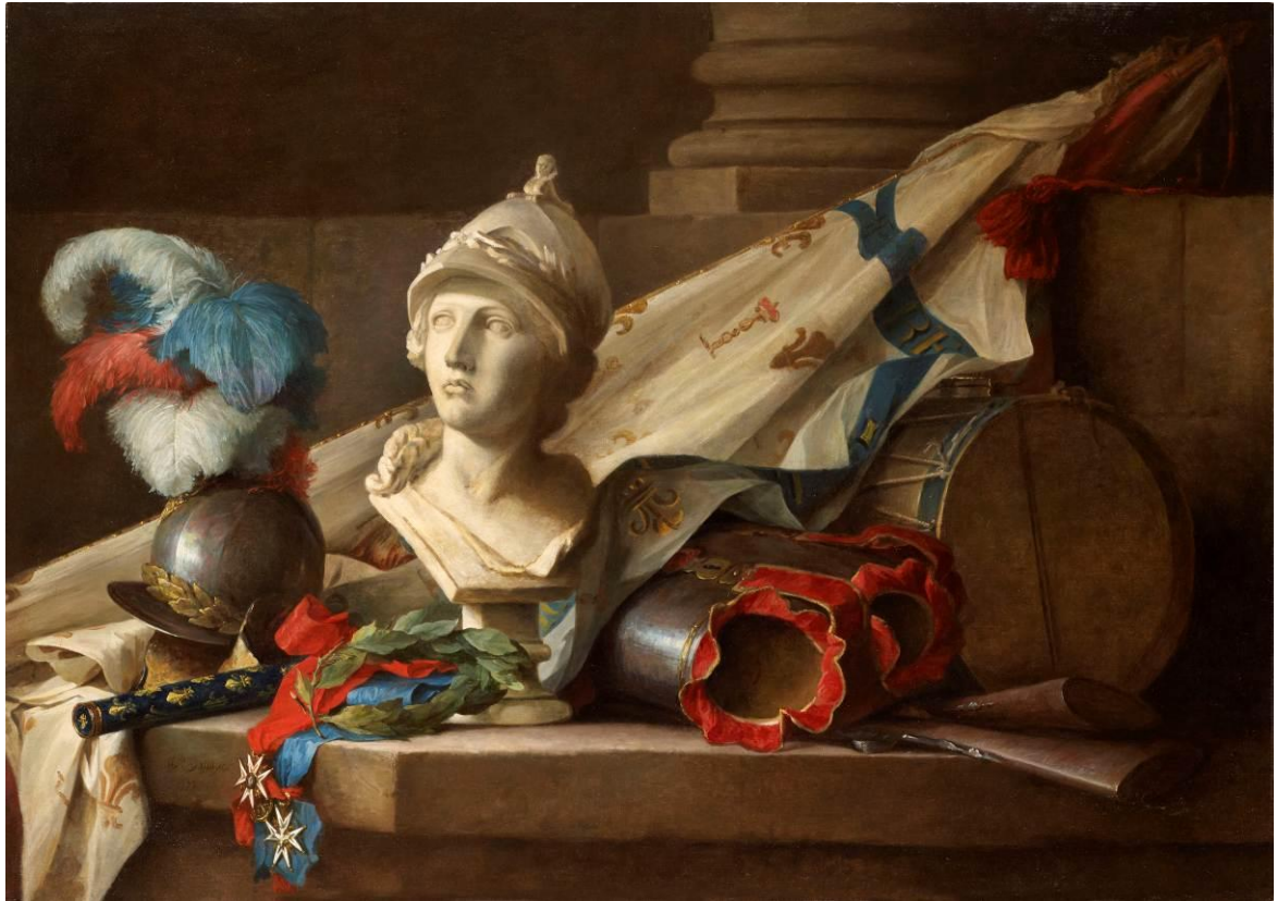
Above ANNE VALLAYER-COSTER 1744 - Paris - 1818

A bust of Minerva, armour, muskets, a drum, a standard, the baton of command of a Maréchal de France, a laurel wreath and the Orders of Saint-Louis and of the Saint-Esprit, all on a stone ledge