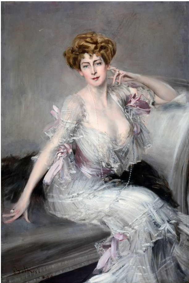
Left GIOVANNI BOLDINI