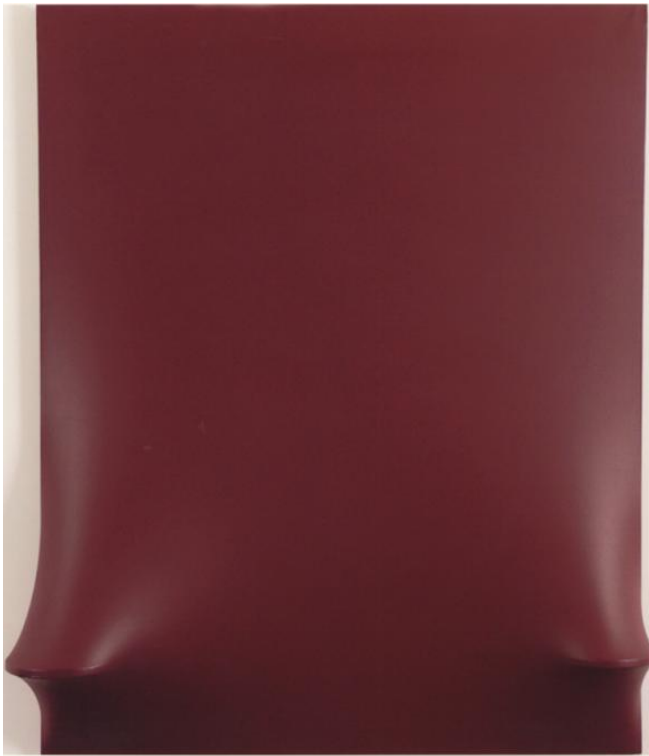
AGOSTINO BONALUMI (B. 1935) Marrone , 1966 Oil on shaped canvas, 150 x 120 cm