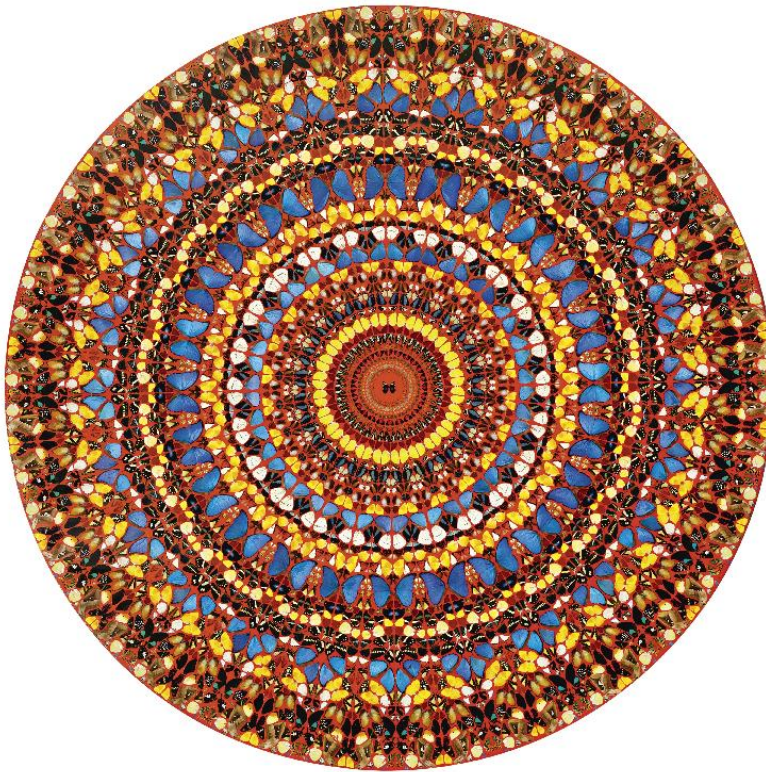
DAMIEN HIRST B. 1965

High Windows (Happy Life) Butterflies and household gloss on canvas Diameter: 243.8 cm / 96 inc Signed, titled and dated 2006 on the reverse