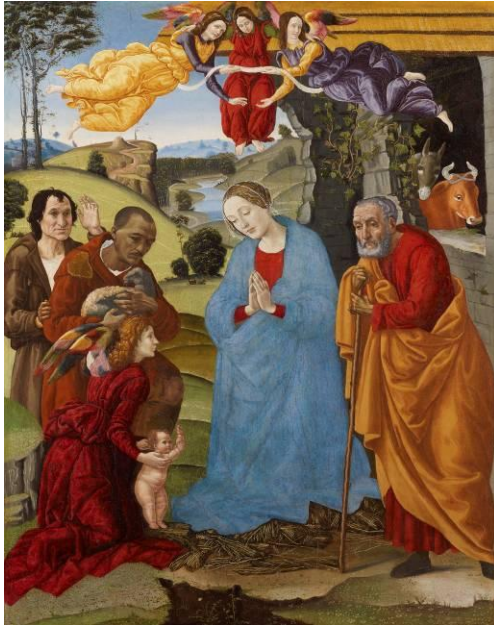
MICHELANGELO DI PIETRO MENCHERINI (previously Maestro del Tondo Lathrop) Pistoia, approx 1460 – Lucca 1525

Adoration of the Shepherds Oil on panel, cm 77.5 x 62 / 30.5 x 24.4 in