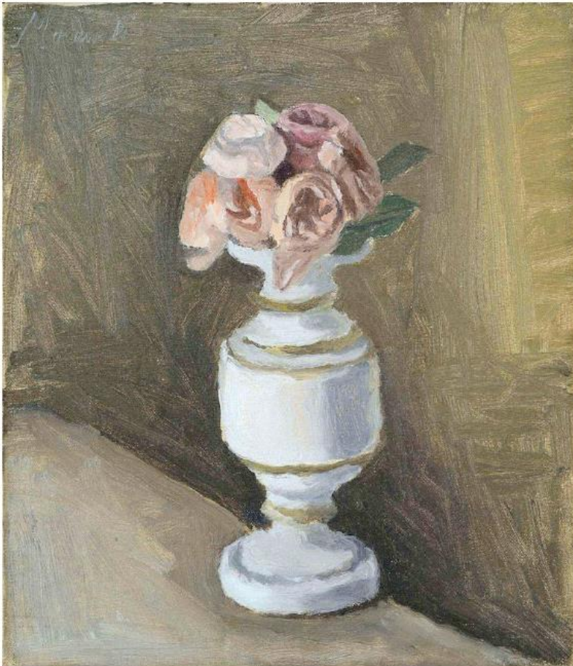
Fiori, by Giorgio Morandi