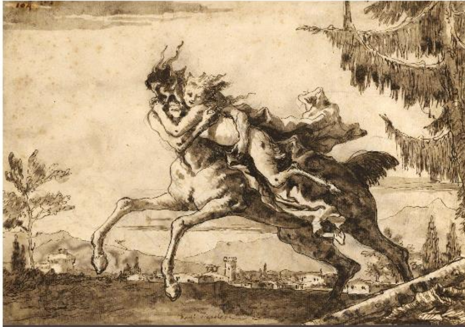
A Centaur Carrying off a Female Faun, by Giovanni Domenico Tiepolo