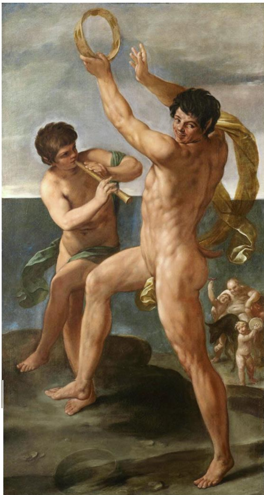
Two Bacchantes, by Guido Reni