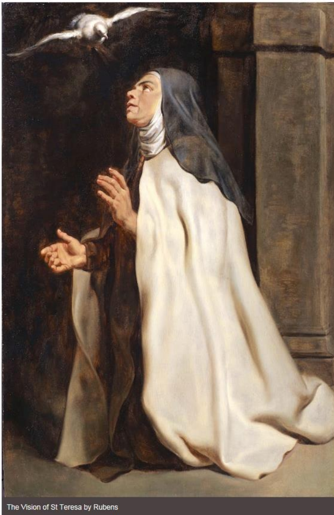
The Vision of St Teresa by Rubens