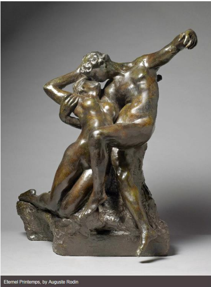
Eternel Printemps, by Auguste Rodin