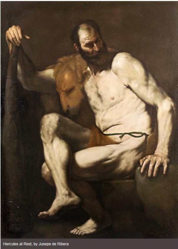
Hercules at Rest, by Jusepe de Ribera