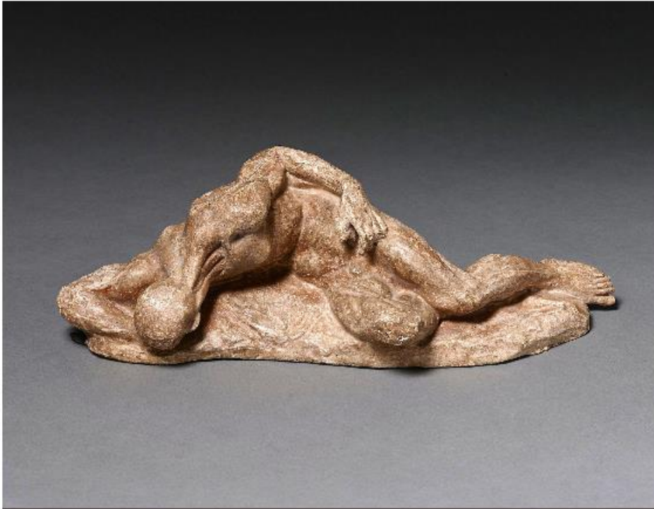
Le Moriband, by Theodore Gericault