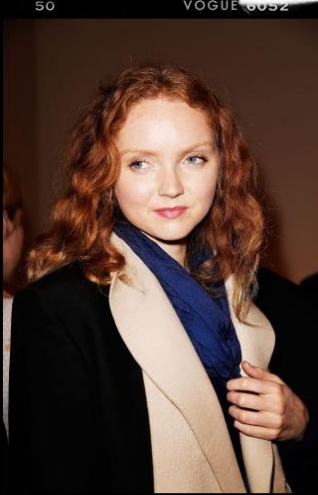
4 ▲ Lily Cole