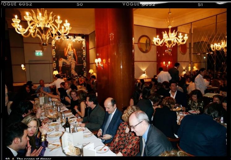
10 ▲ The scene of dinner